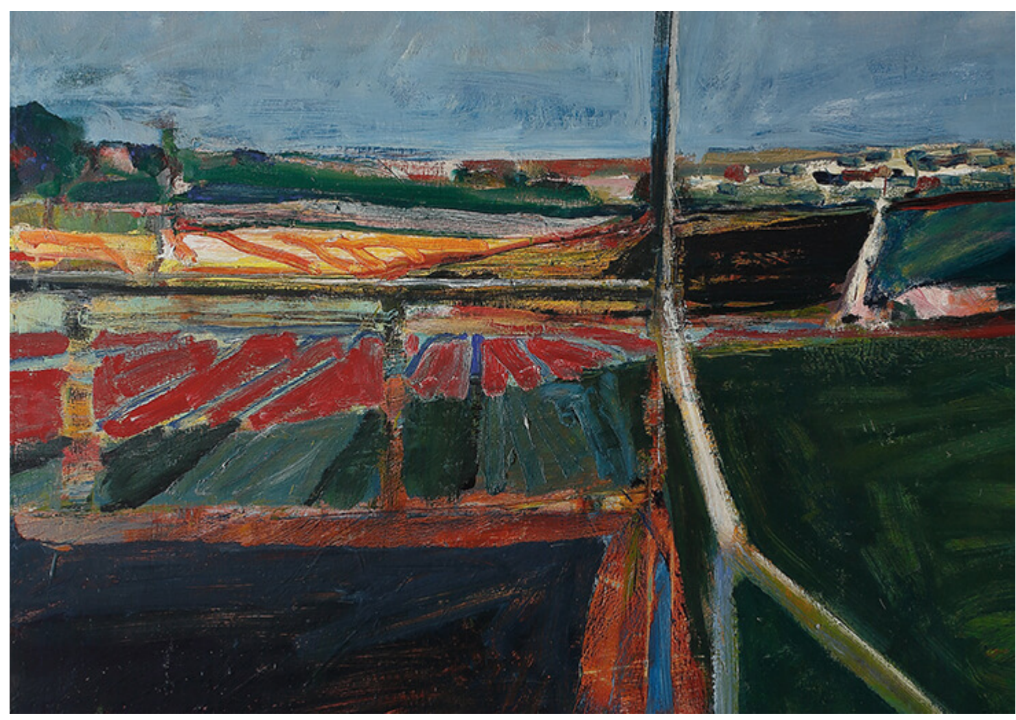
Richard Diebenkorn, View from a Porch, 1959

By the time he painted Touched Red, 1991, Diebenkorn had moved into a cleaner and less painterly style, dominated by light-infused pastel tones. Yet red was still his favourite accent, and the title of this print tells us how integral the colour was to his overall design. Thin veils of soft beige are loosely washed across the background, shifting ever-so-slightly like folded fabric catching the light. The main red accent is in the upper left, a shard of boldness as angular as a cut scrap of paper. So it doesn't look too isolated, Diebenkorn introduces this same dark red in loose ripples and threads that run down the left side. In the background, traces of pale red lines are almost invisible, as if disappearing into the distance. Along with these domineering red accents, Diebenkorn brings a scattered arrangement of unconventional hues, including ultramarine blue, cadmium yellow, turquoise and just the